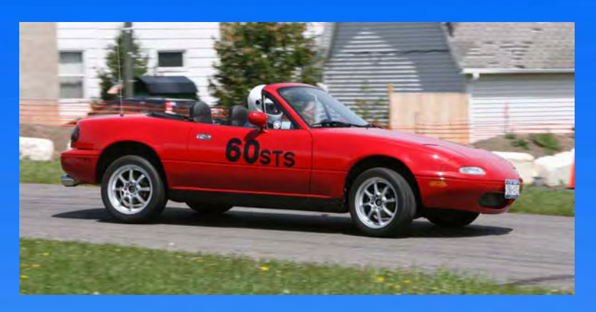
trouble just because he liked to work on his cars).

For instance, how about potential new laws limiting an owner from modifying their vehicle? Or "junk vehicle" zoning laws that could prohibit you from working on, and storing at your own house, that new competition project car you are building because some government official thinks it is not appropriate for the neighborhood? (Don't get me wrong, there are appropriate limits. I don't want a junk yard next to me either, but we've all heard of the extreme examples of how some car enthusiast has gotten into legal