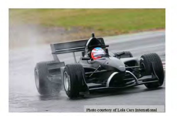
Current supplier to LOLA CARS INTERNATIONAL