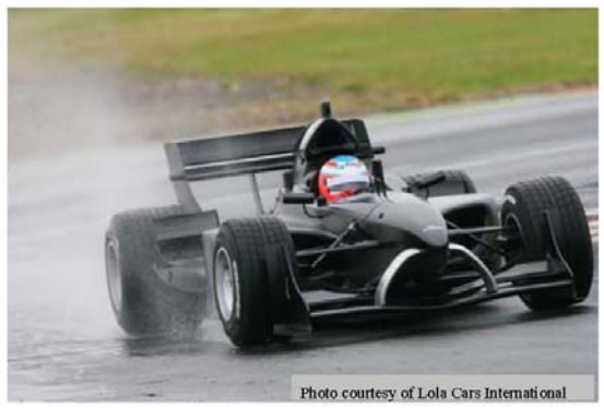
Current supplier to LOLA CARS INTERNATIONAL