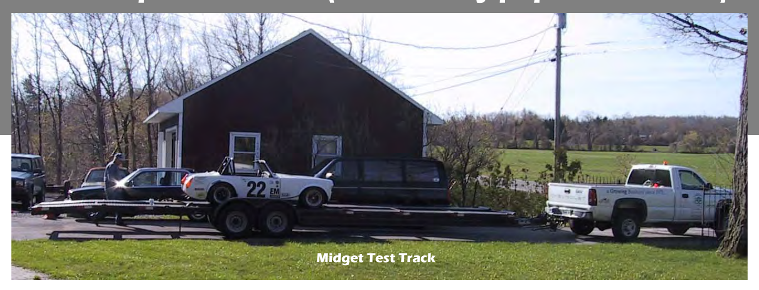
Caption by Roy Hopkins