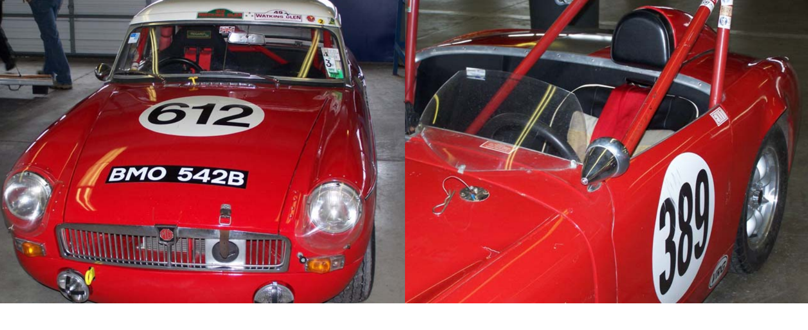
Some of the cars at the VRG weekend