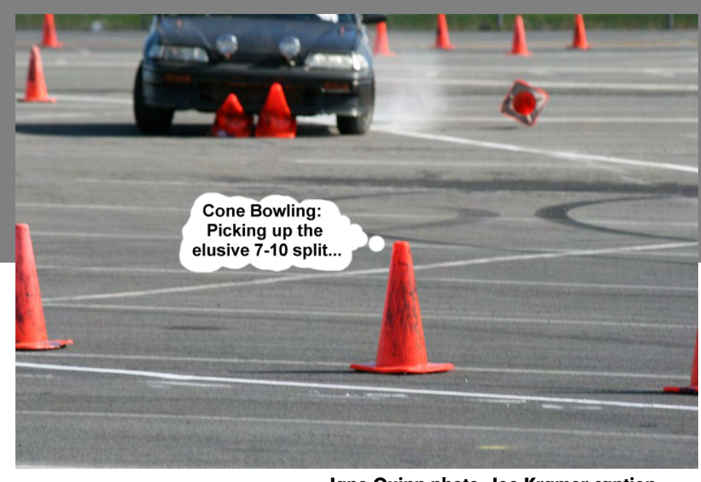
- Jane Quinn photo, Joe Kramer caption

Please send in your entry to khughes@cnyira.com, with "Caption Contest" in the subject line.