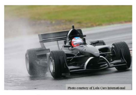
Current supplier to LOLA CARS INTERNATIONAL

http://www.nescca.com/nescca_main/calendar.html